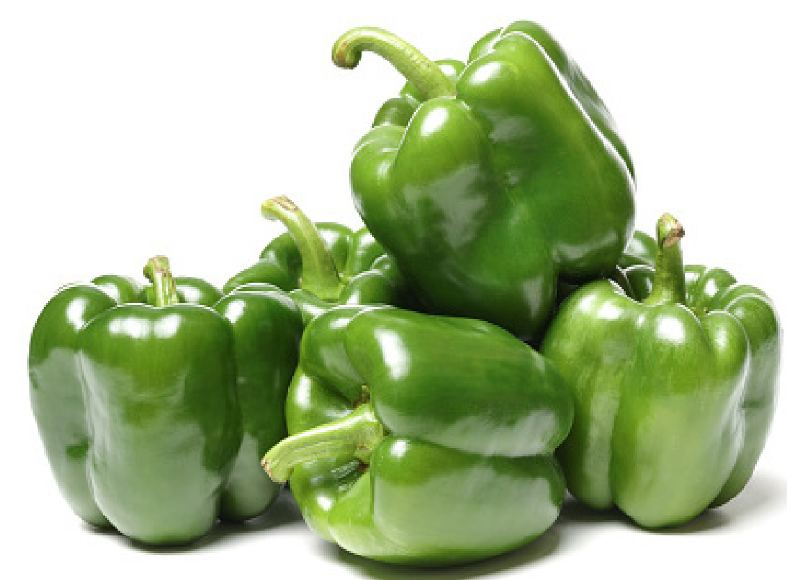
Fresh Picked Green Bell Peppers $1.49 lb.