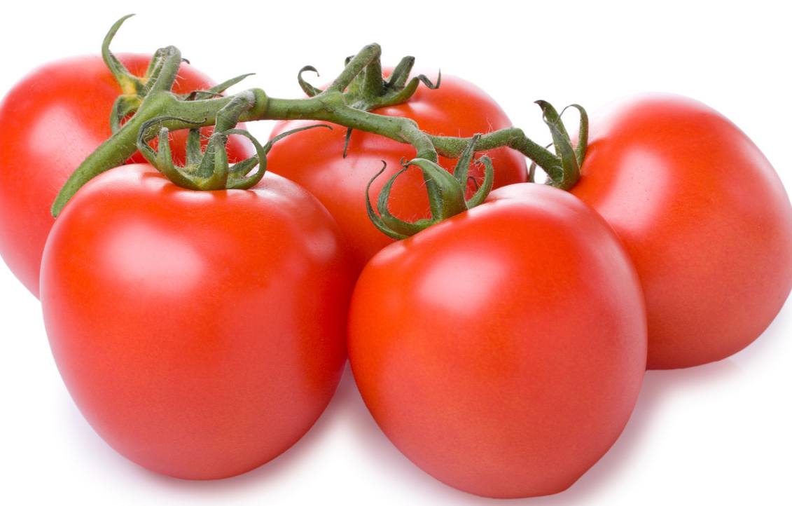
Red, Ripe On the Vine Cluster Tomatoes $1.99 lb.