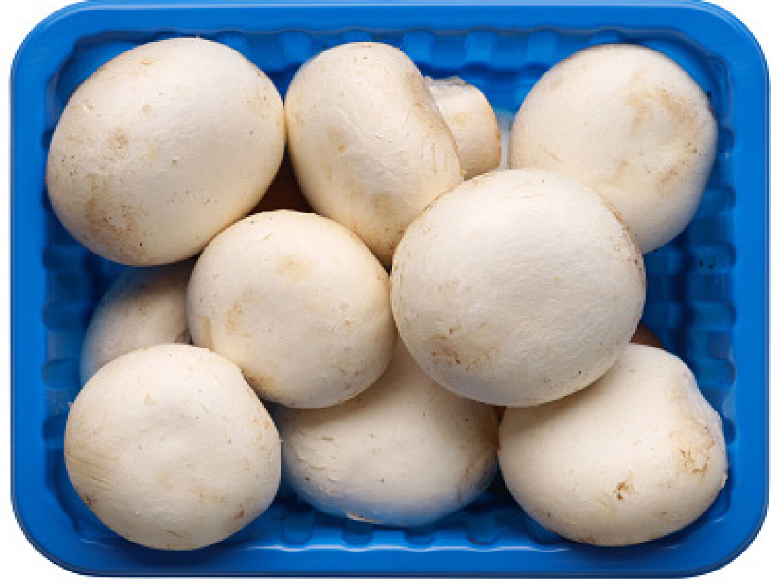
8 oz. Box Whole White Mushrooms 2 for $4