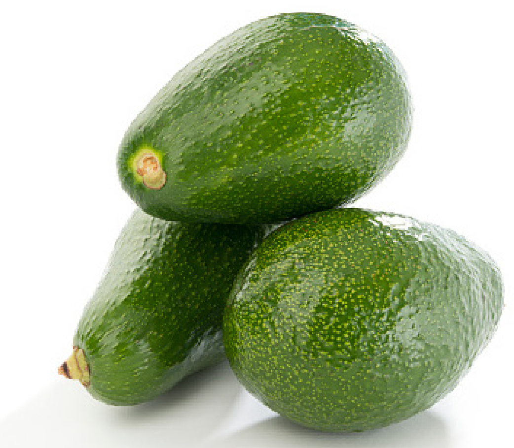
Large Hass Avocados 4 for $5