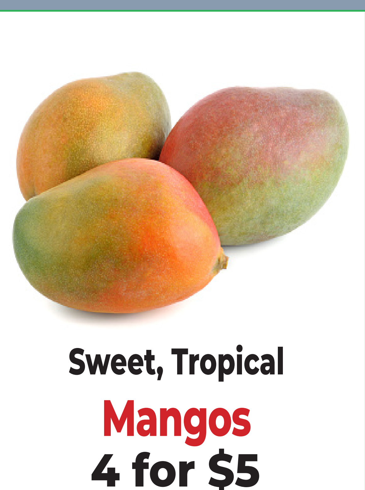
Sweet, Tropical Mangos 4 for $5