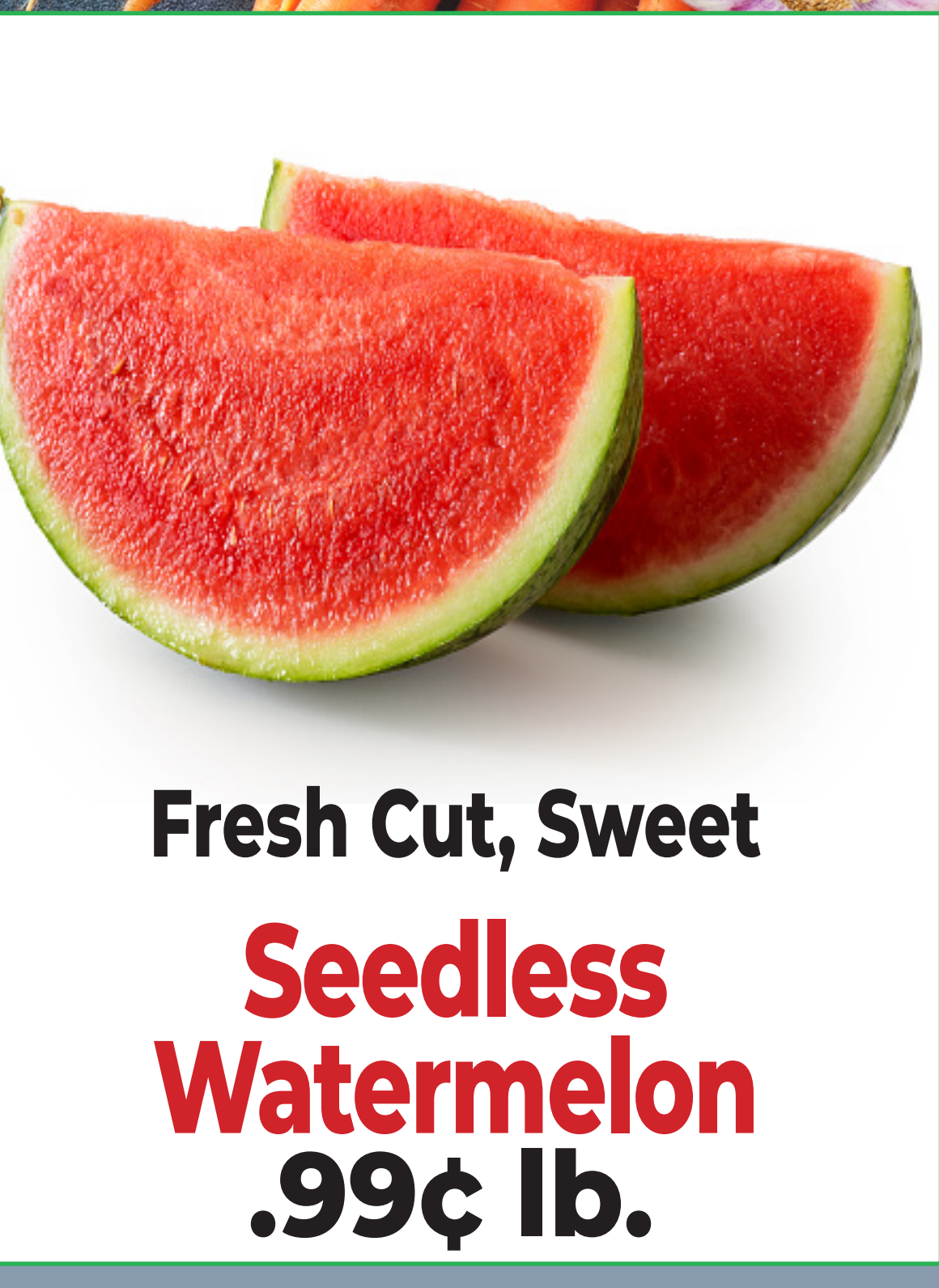
Fresh Cut, Sweet Seedless Watermelon .99¢ lb.

MON-SAT 8AM-8PM SUN 8AM-7PM DELI HOURS DAILY 8AM-7PM