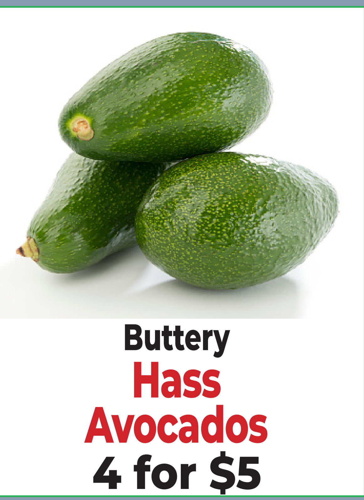
Buttery Hass Avocados 4 for $5