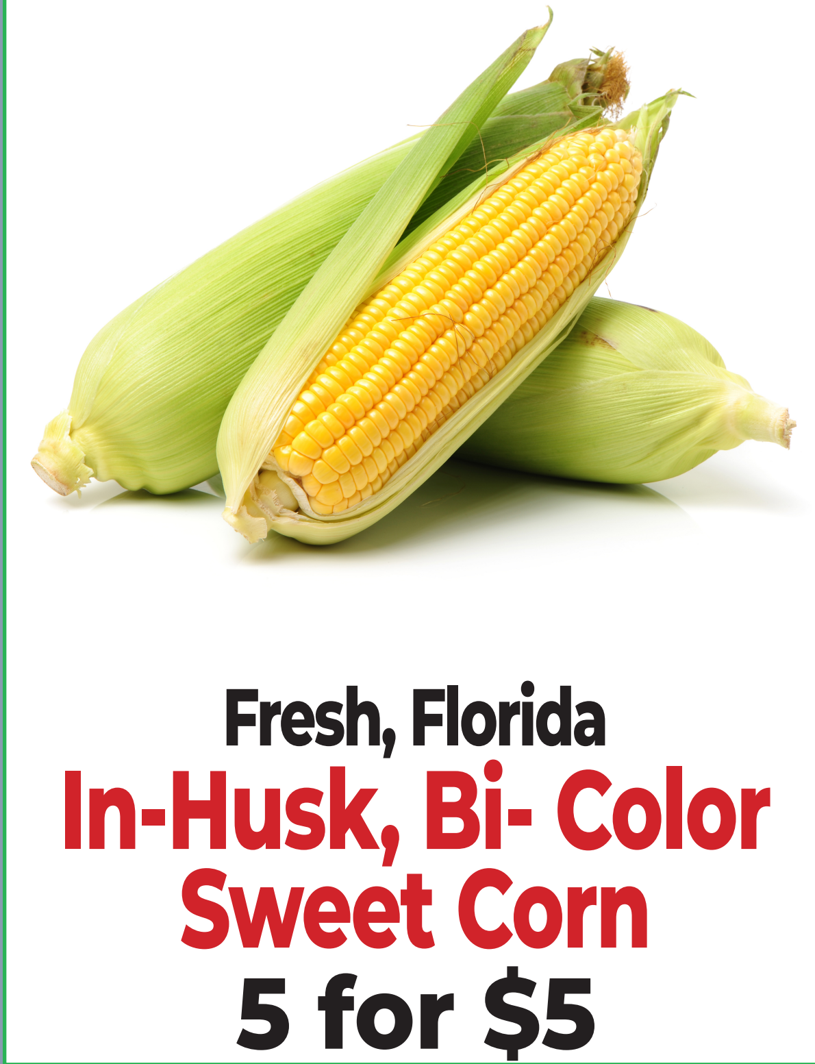
Fresh, Florida In-Husk, Bi-Color Sweet Corn 5 for $5