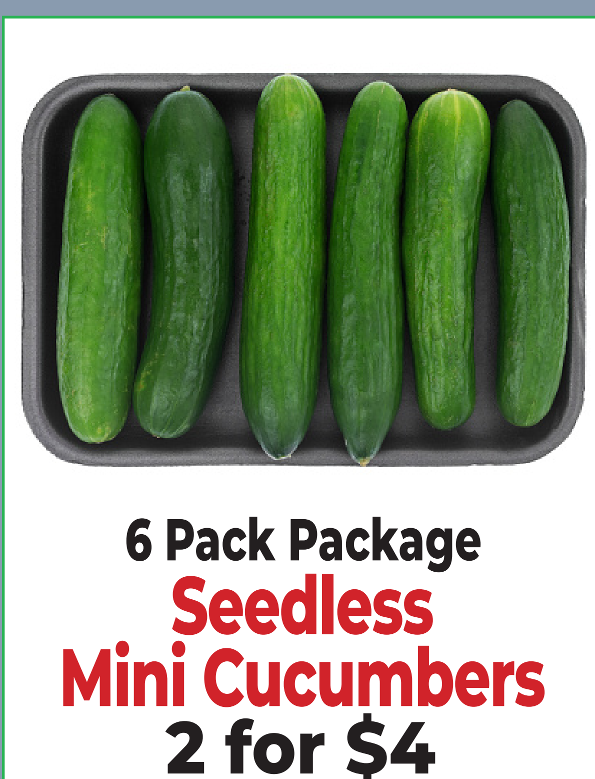
6 Pack Package Seedless Mini Cucumbers 2 for $4