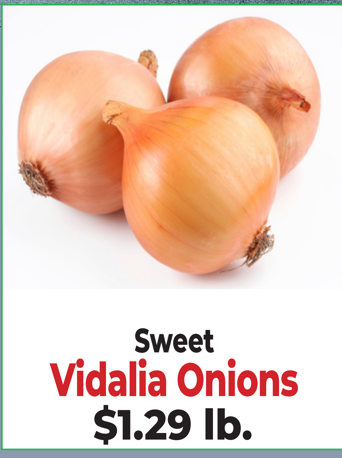
Sweet Vidalia Onions $1.29 lb.