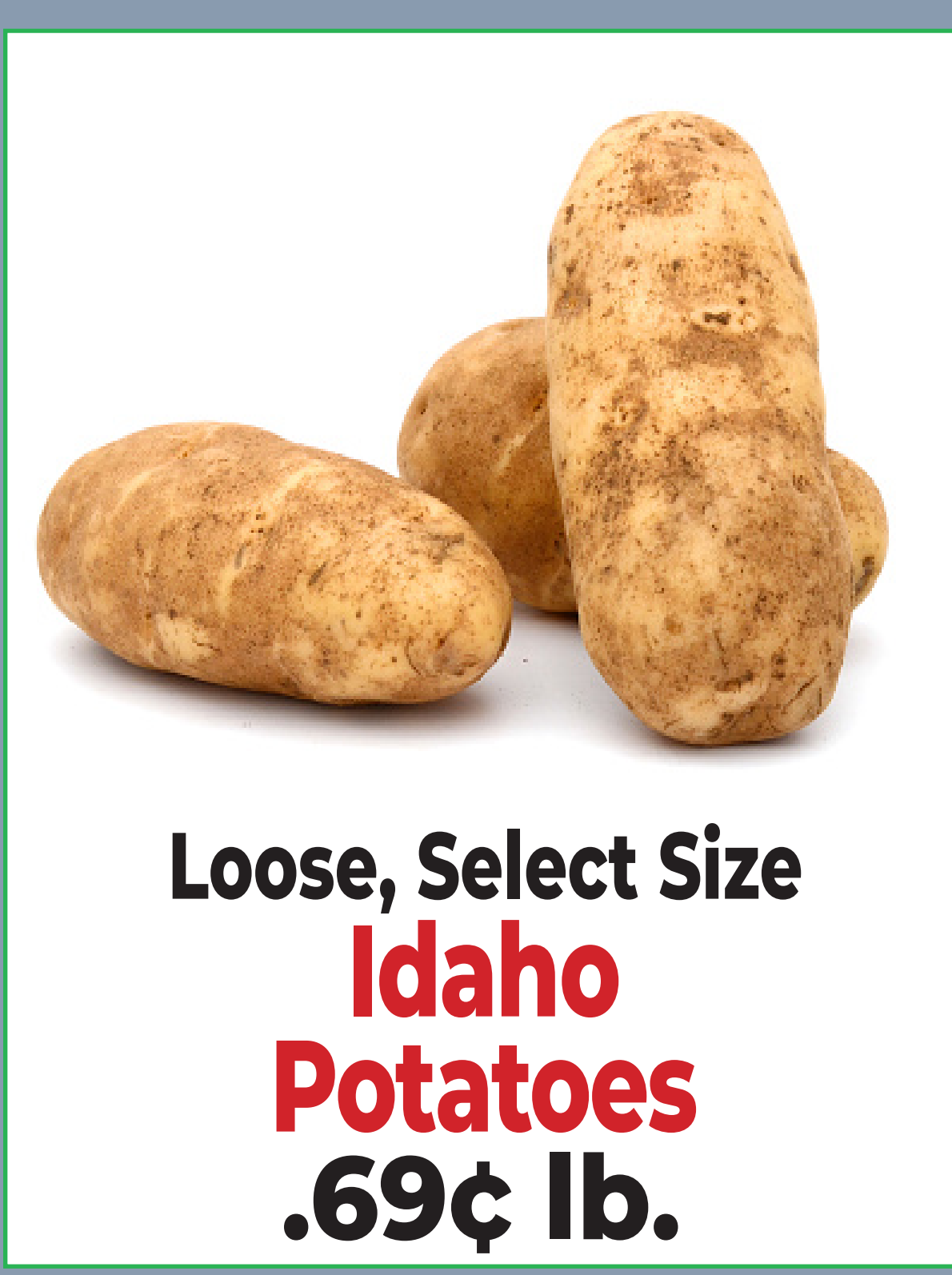
Loose, Select Size Idaho Potatoes .69¢ lb.