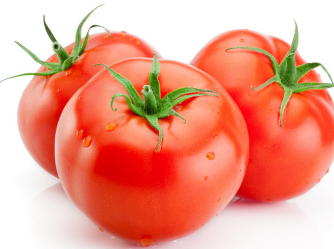
Red, Ripe Beefsteak Tomatoes $1.99 lb.