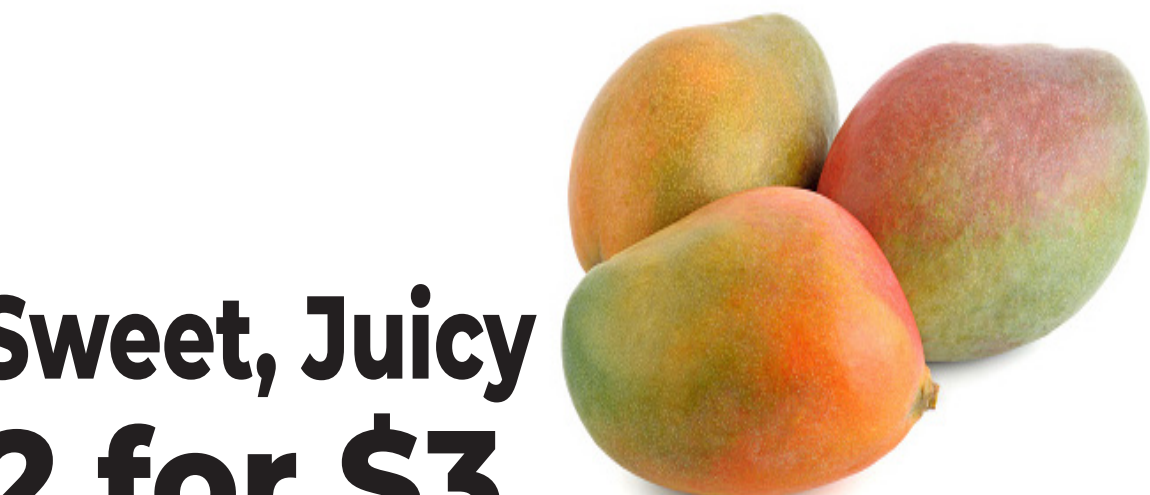
Sweet, Juicy 2 for $3 Mangos