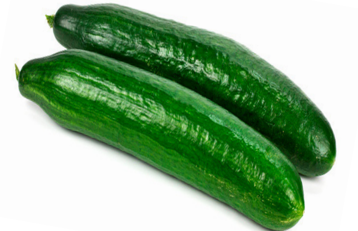
Fresh Picked Seedless English Cucumbers .99¢ ea.