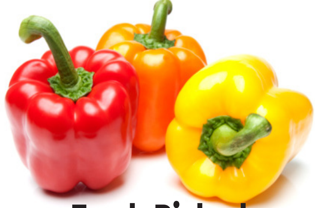
Fresh Picked Red, Yellow, or Orange Bell Peppers $2.99 lb.