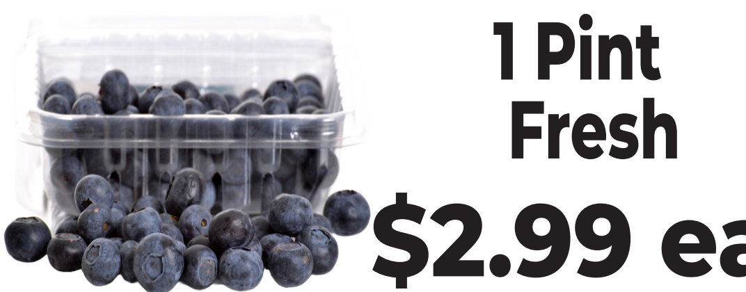
1 Pint Fresh $2.99 ea. Blueberries