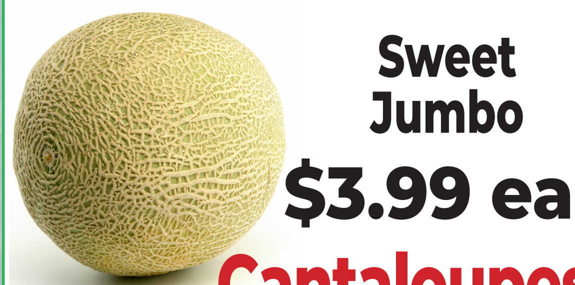
Sweet Jumbo $3.99 ea. Cantaloupes