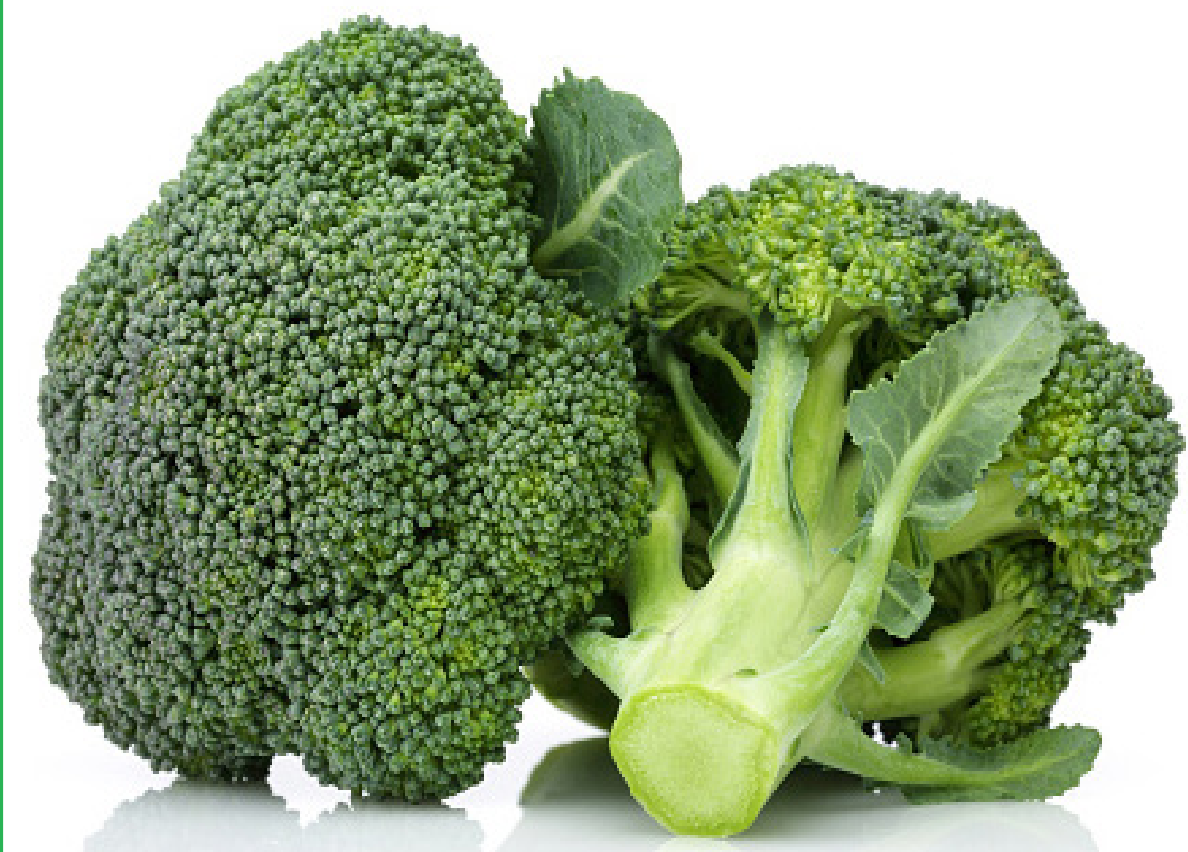
Fresh Bunched California Broccoli 2 for $5