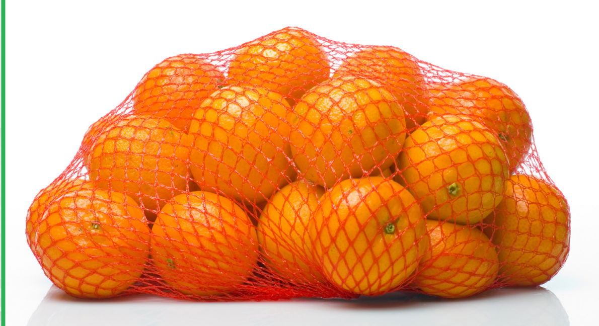
3 lb. Bags California Clementines $4.99 ea.