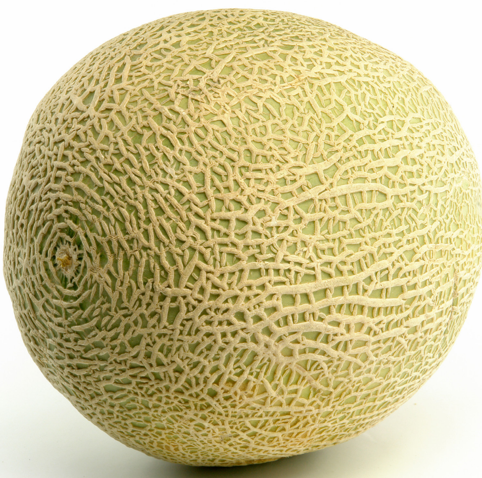
Sweet Jumbo Cantaloupe $2.99 ea.