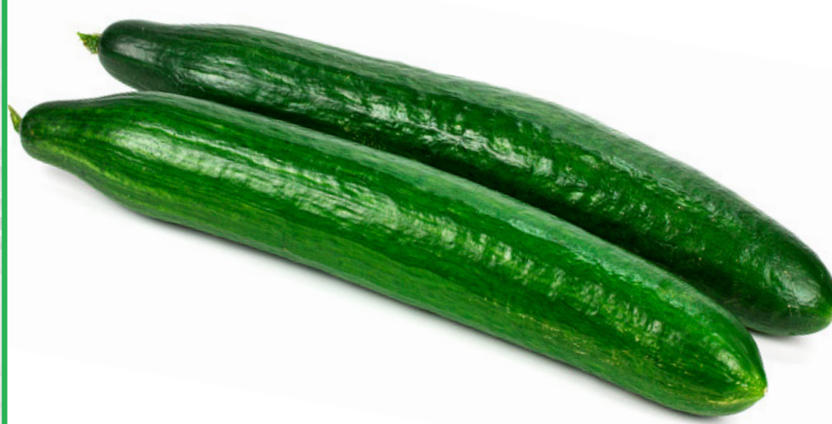
Seedless English Cucumbers 2 for $3