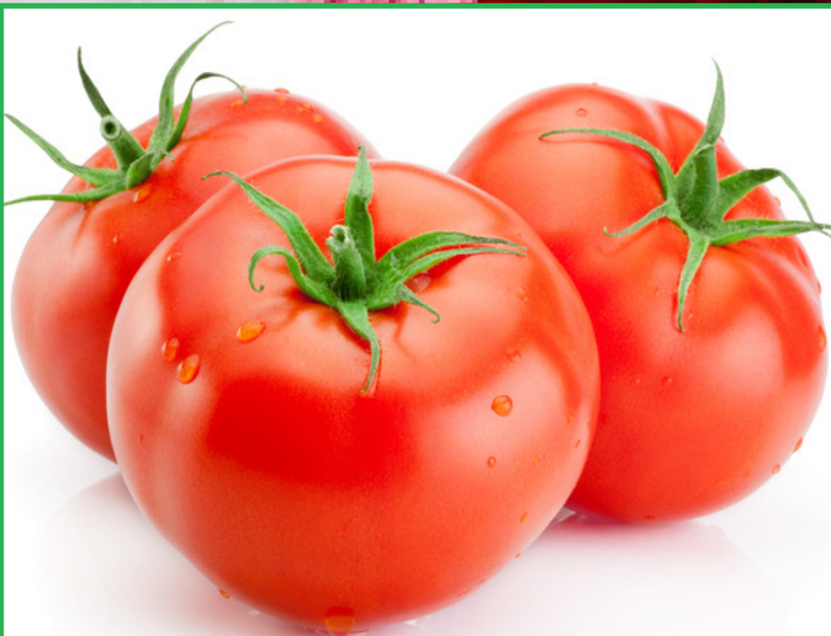
Canadian Grown Beefsteak Tomatoes $1.49 lb.