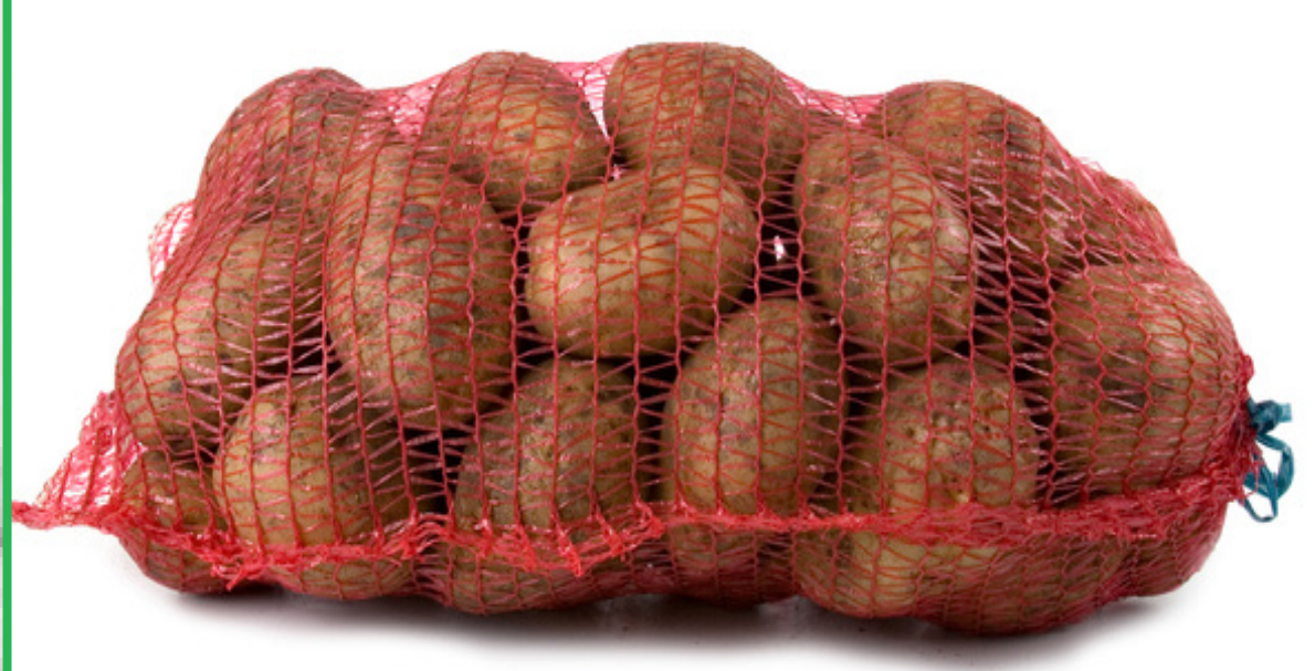
5 lb. Bags Idaho Potatoes 2 for $4