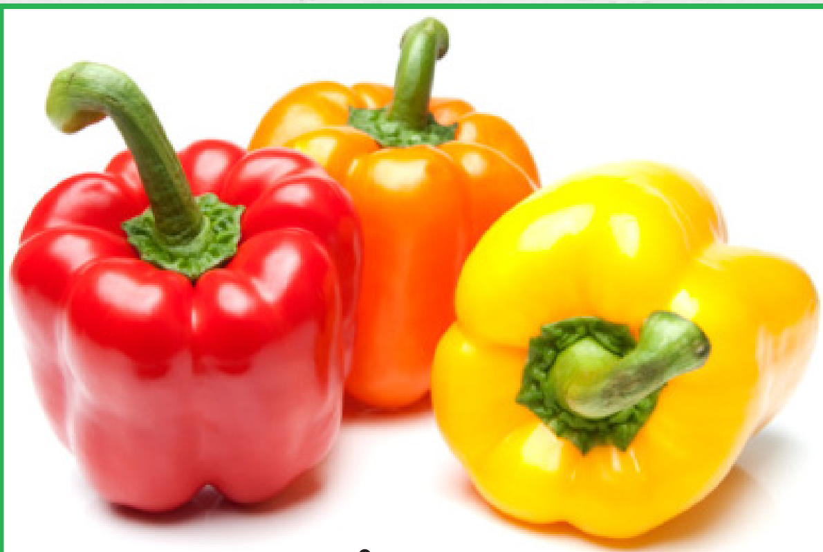
Canadian Grown Red, Yellow, or Orange Sweet Bell Peppers $2.49 lb.