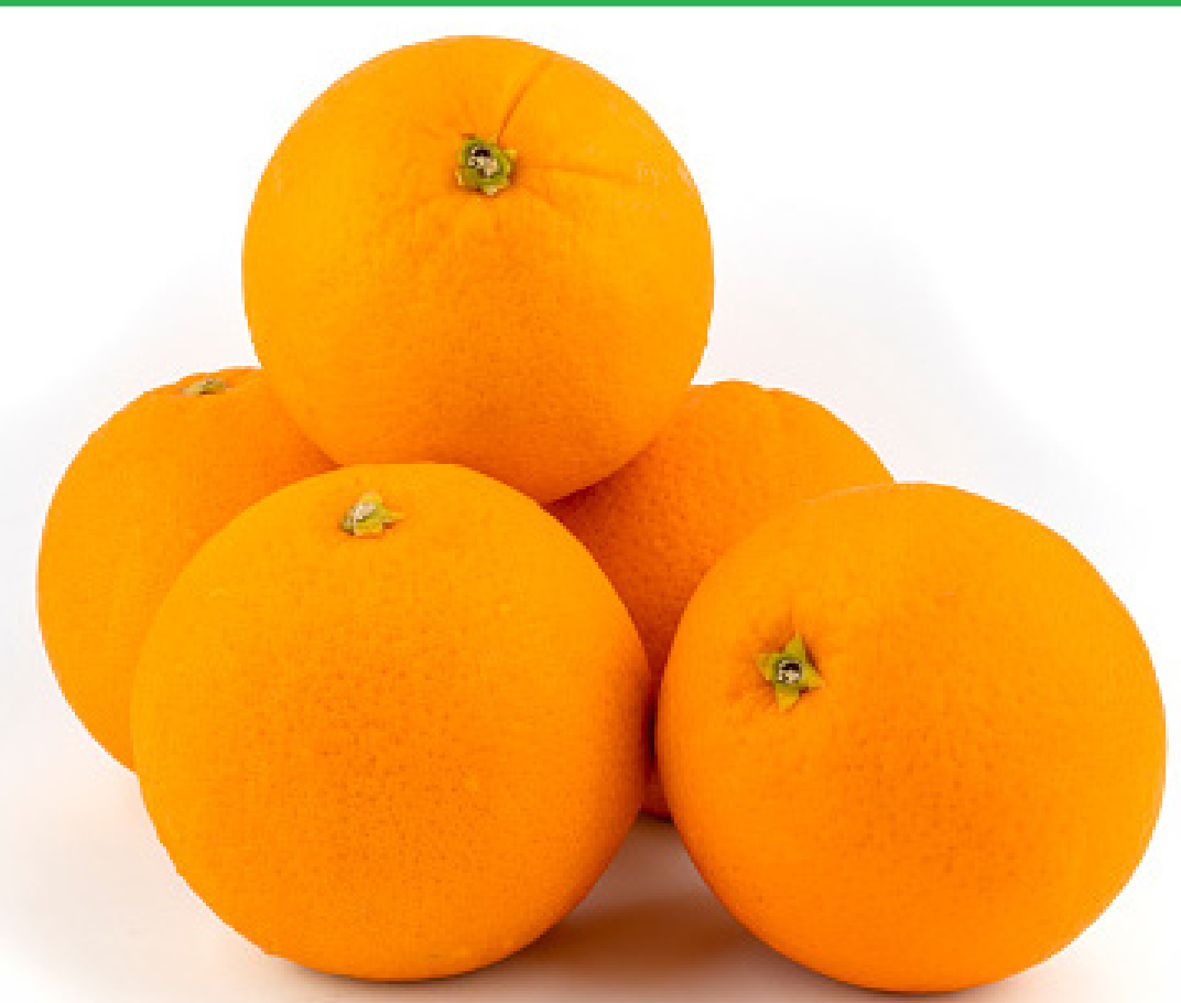
Large Seedless Navel Oranges 5 for $5