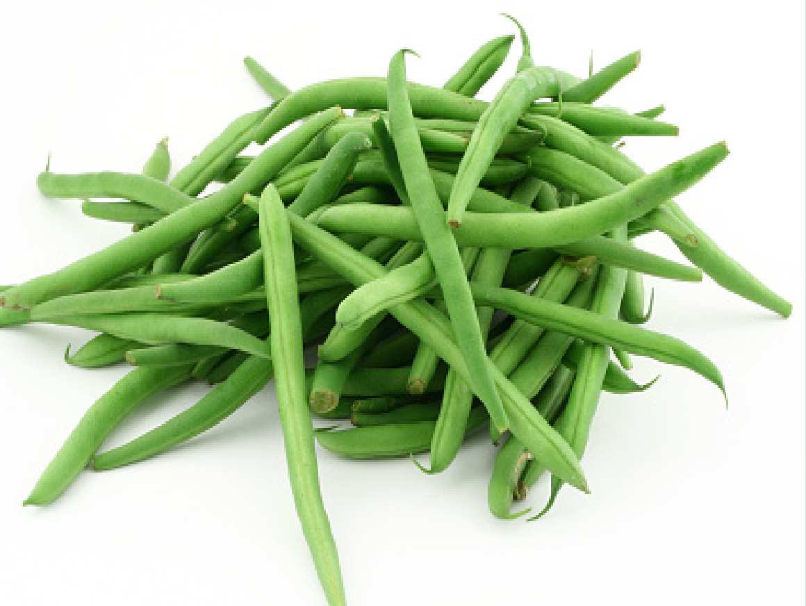
Fresh Picked Green Beans $1.99 lb.

MON-SAT 8AM-8PM SUN 8AM-7PM DELI HOURS DAILY 8AM-7PM