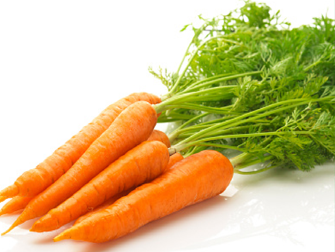
Fresh Bunched Organic Carrots $2.99 ea.