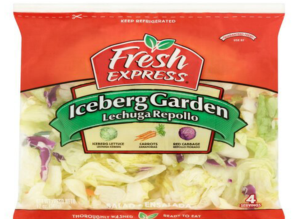
12 oz Bags Fresh Express Garden Salad 2 for $4