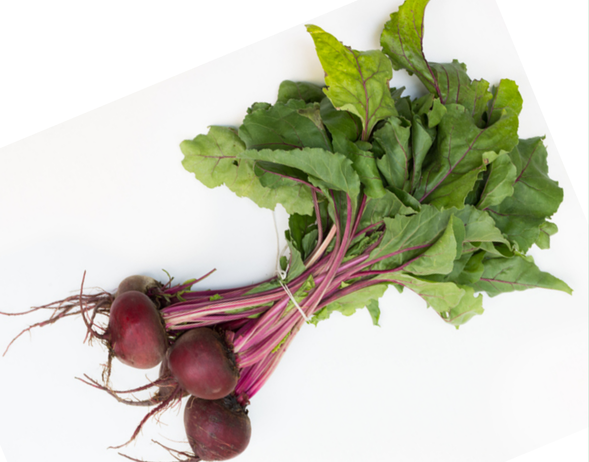
Fresh Bunched Organic Red Beets $2.99 ea.