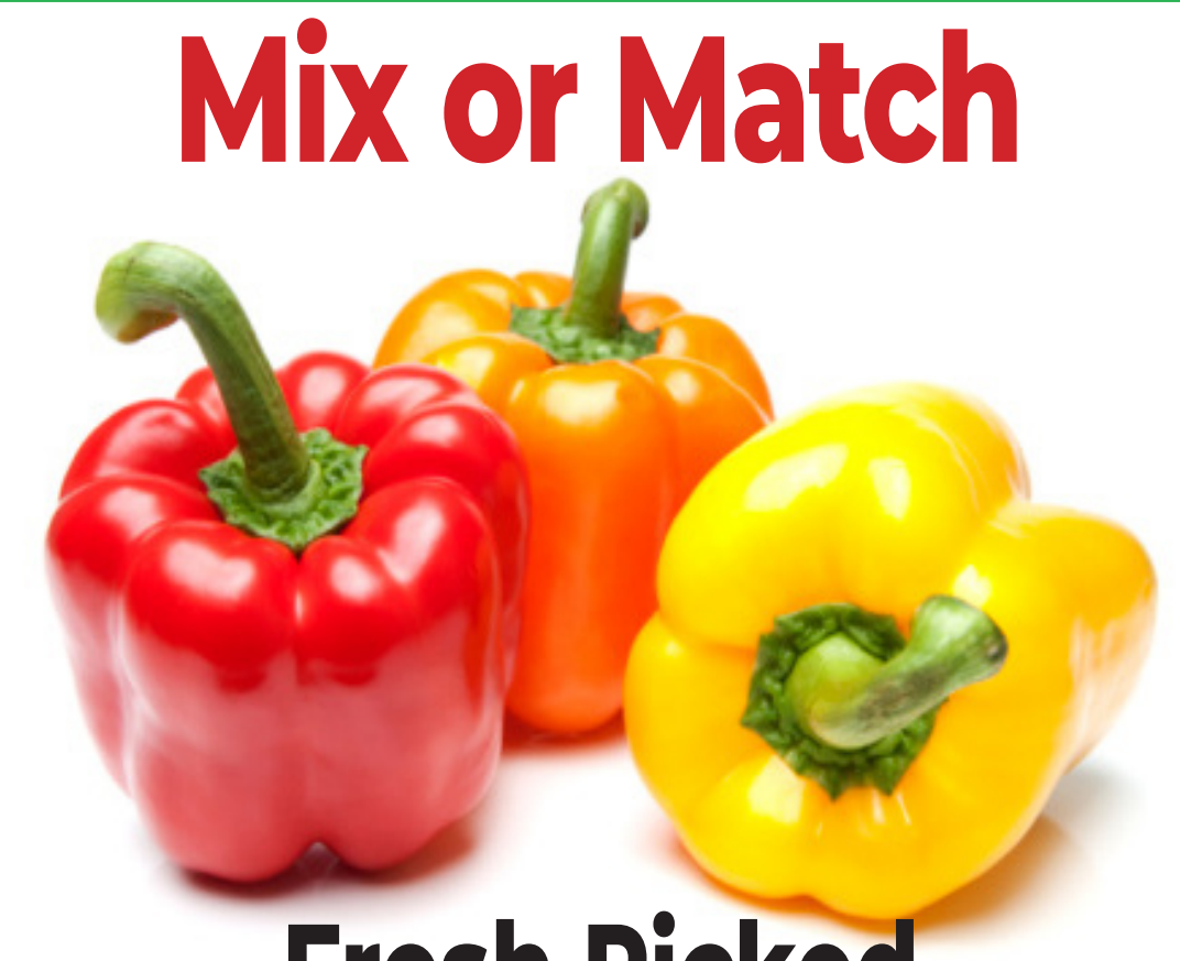
Mix or Match Fresh Picked Red, Yellow, or Orange Bell Peppers $2.99 lb.