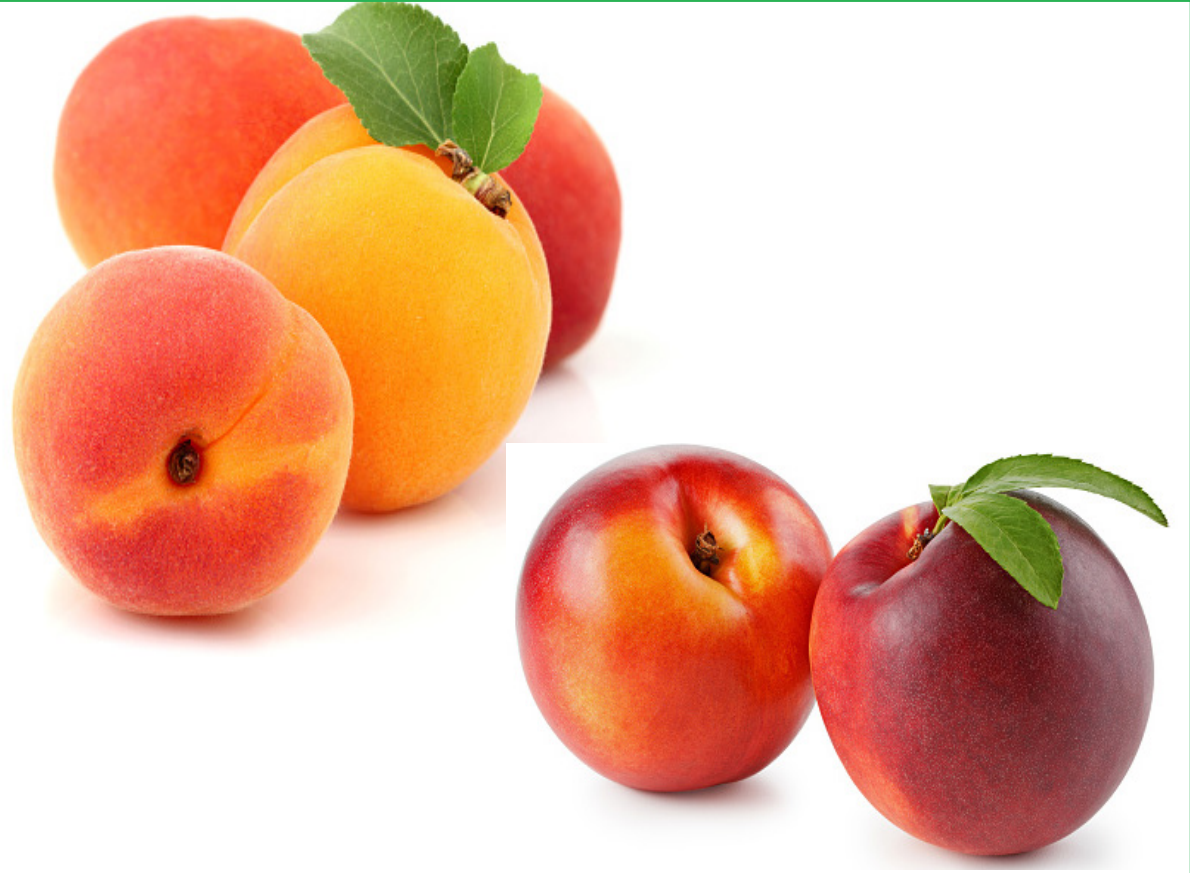
Fresh California Tree Ripened Peaches & Nectarines $2.99 lb.