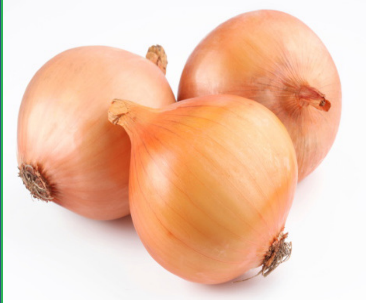
Sweet Vidalia Onions $1.29 lb.