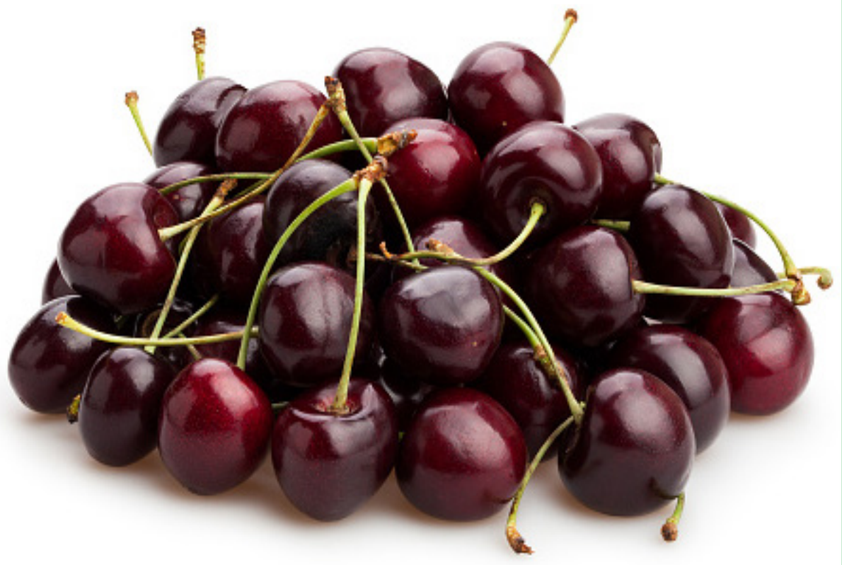
Fresh Washington State Red Cherries $3.99 lb.