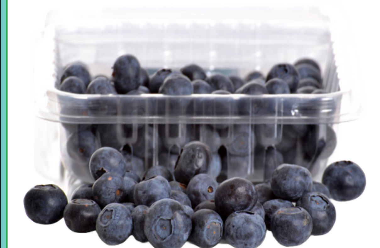
Fresh Picked 1 Full Pint Blueberries $3.99 ea.