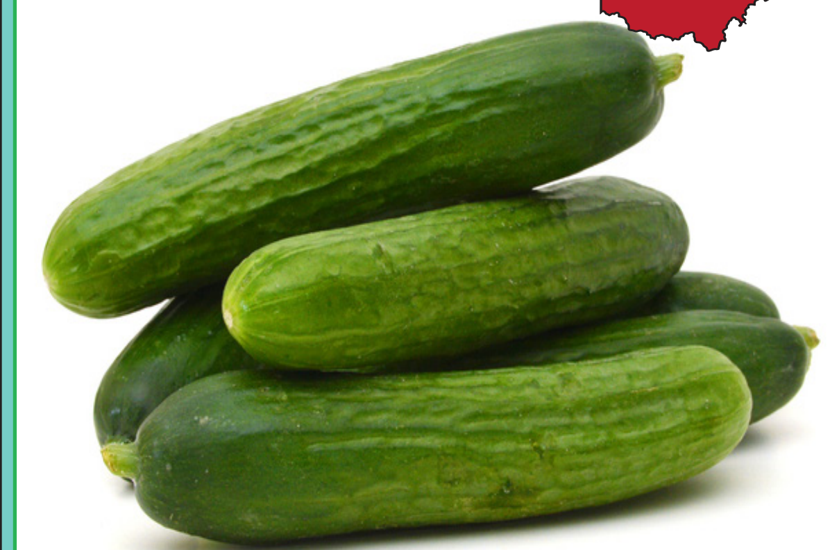
Ohio Grown Cucumbers .99¢ ea.