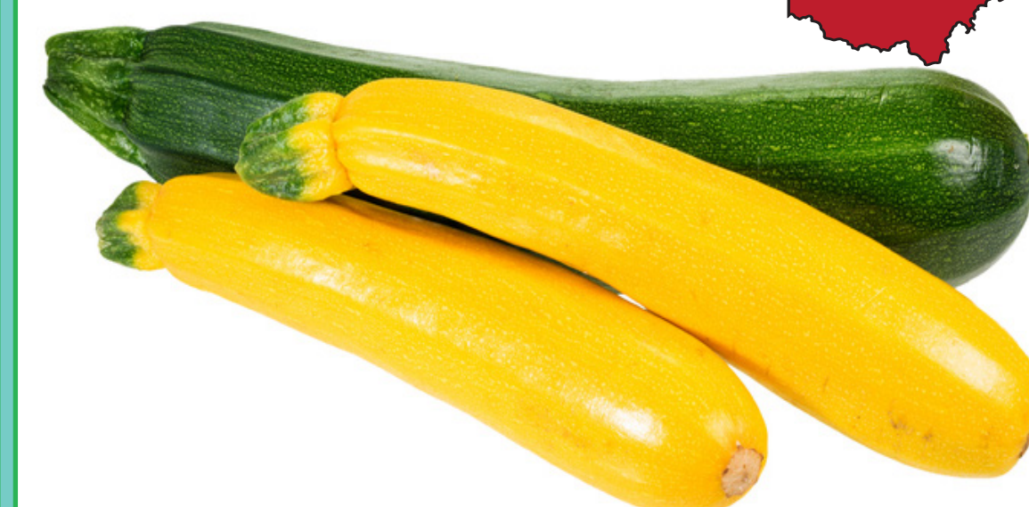
Ohio Grown Green Zucchini or Yellow Squash $1.49 lb.