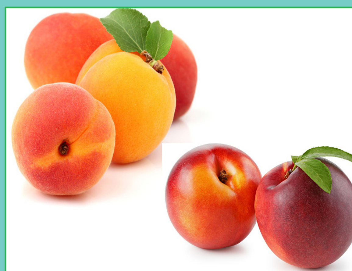
Fresh California Tree Ripened Peaches & Nectarines $2.99 lb.