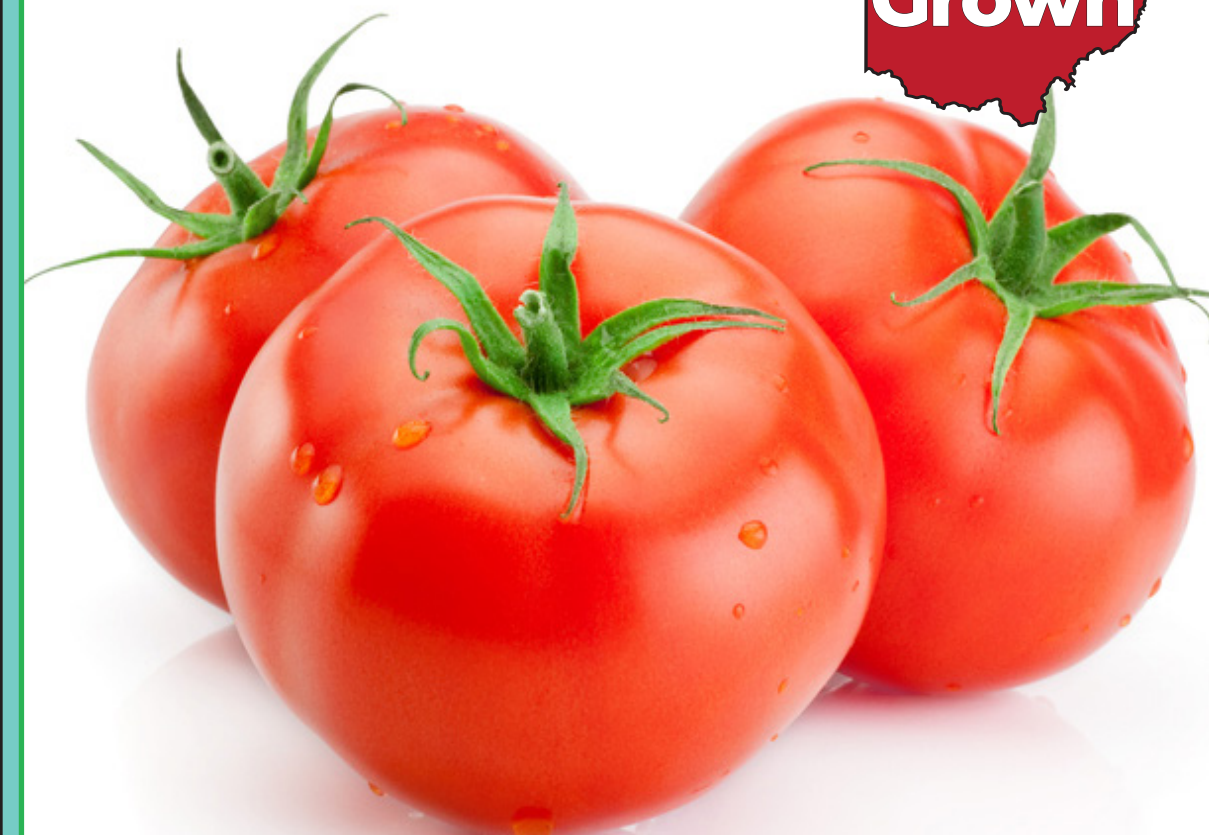
Ohio Grown Tomatoes $2.49 lb.