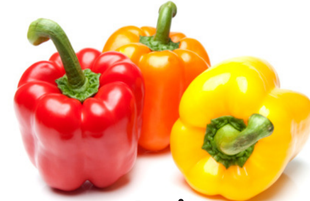
Fresh Picked Red, Yellow, or Orange Bell Peppers $2.49 lb.