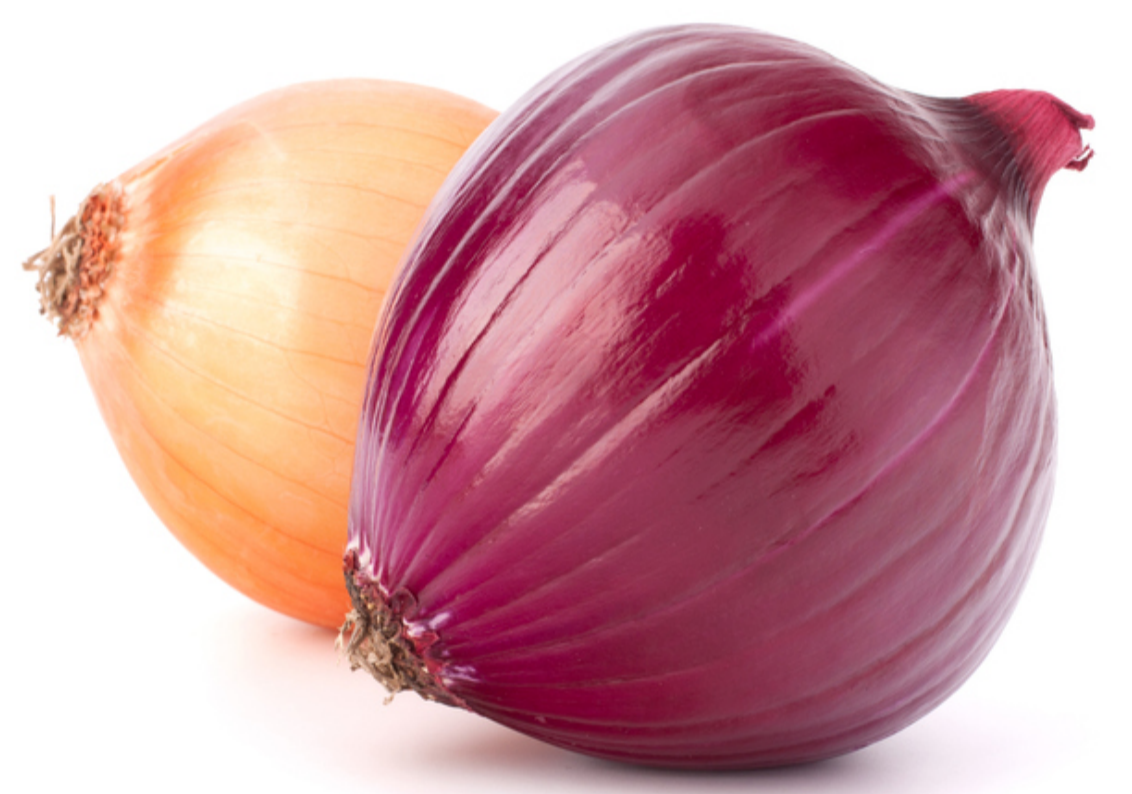
Red or Vidalia Onions $1.29 lb.