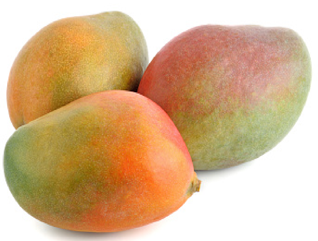
Sweet, Tropical Mangos 4 for $5