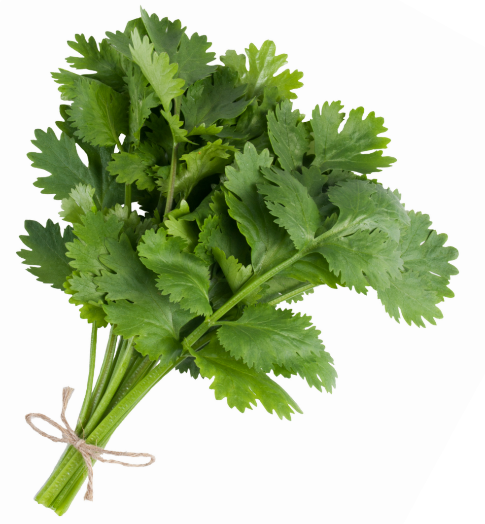
Fresh Bunched Cilantro .99¢ ea.