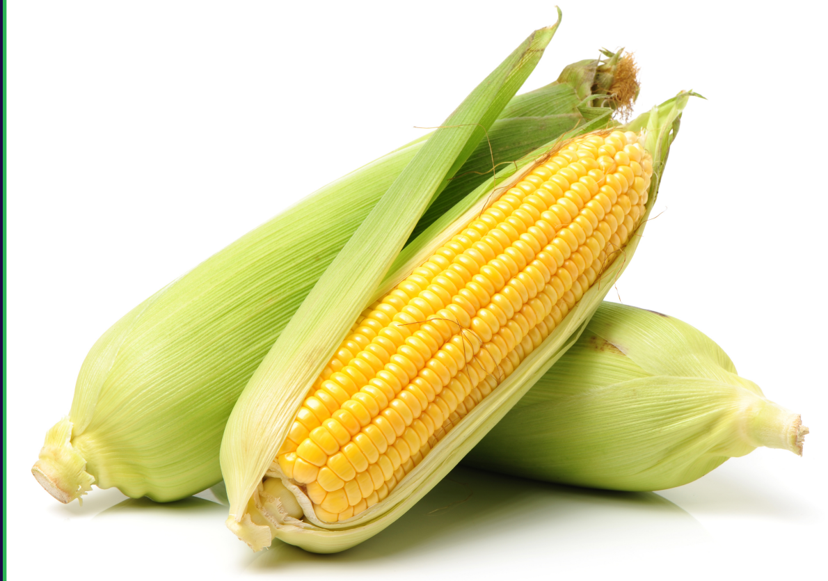
Fresh, Florida In-Husk, Bi- Color Sweet Corn 5 for $5