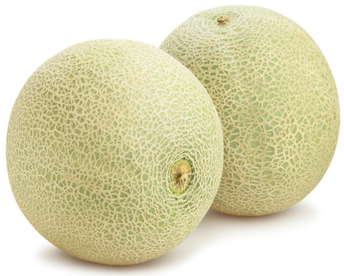
Sweet, Jumbo Cantaloupes $3.99 ea.