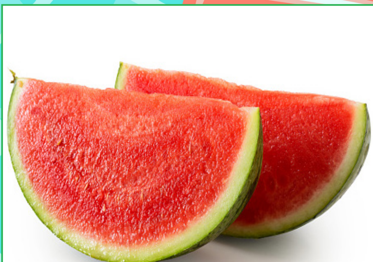
Fresh Cut, Sweet Seedless Watermelon .99¢ lb.