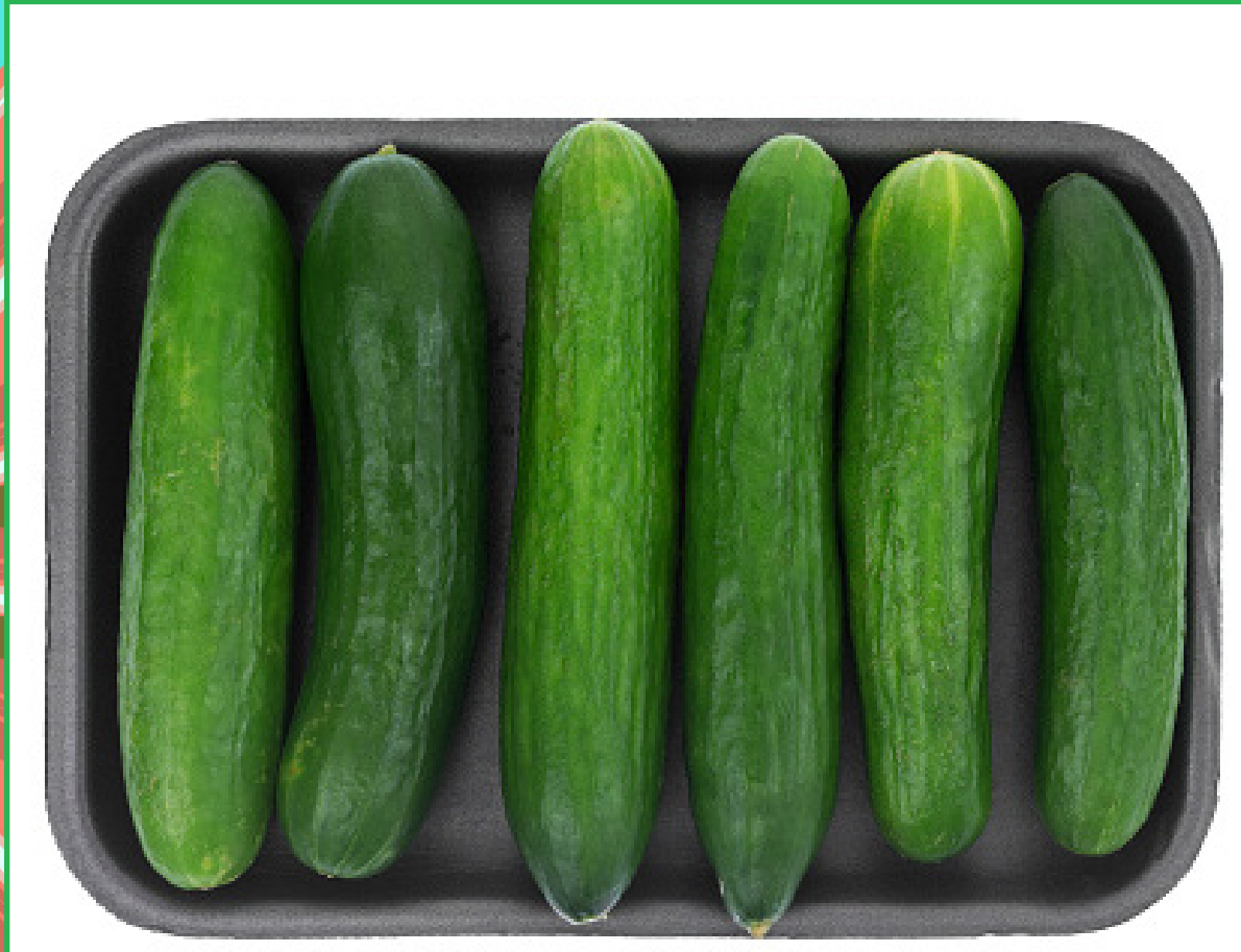
6 Pack Package Seedless Mini Cucumbers 2 for $4