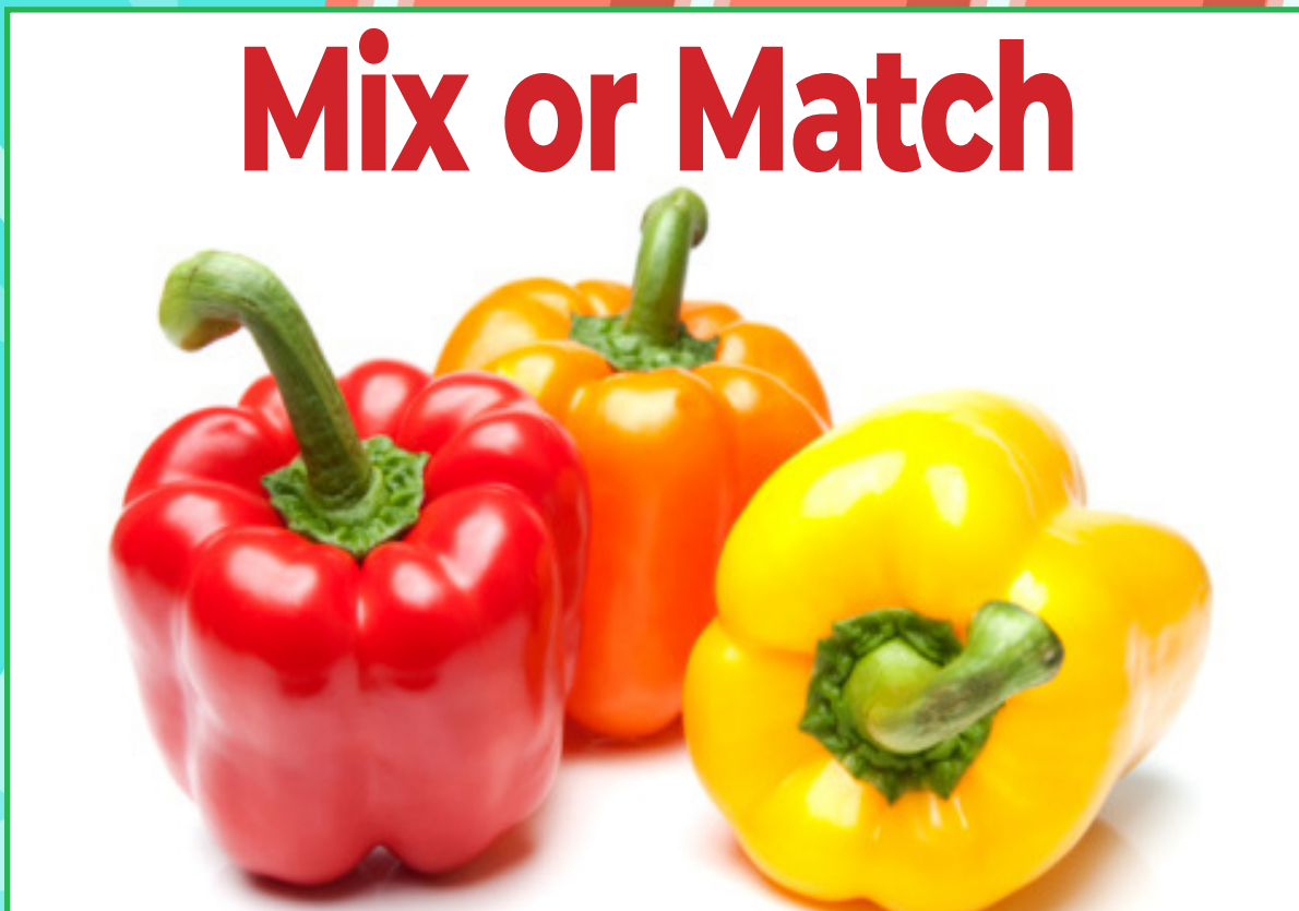
Fresh Picked Red, Yellow, or Orange Bell Peppers $2.99 lb.