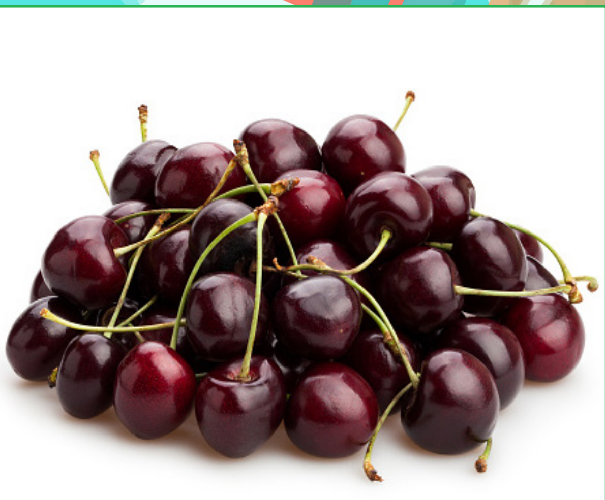
Northwest Cherries $3.99 lb.