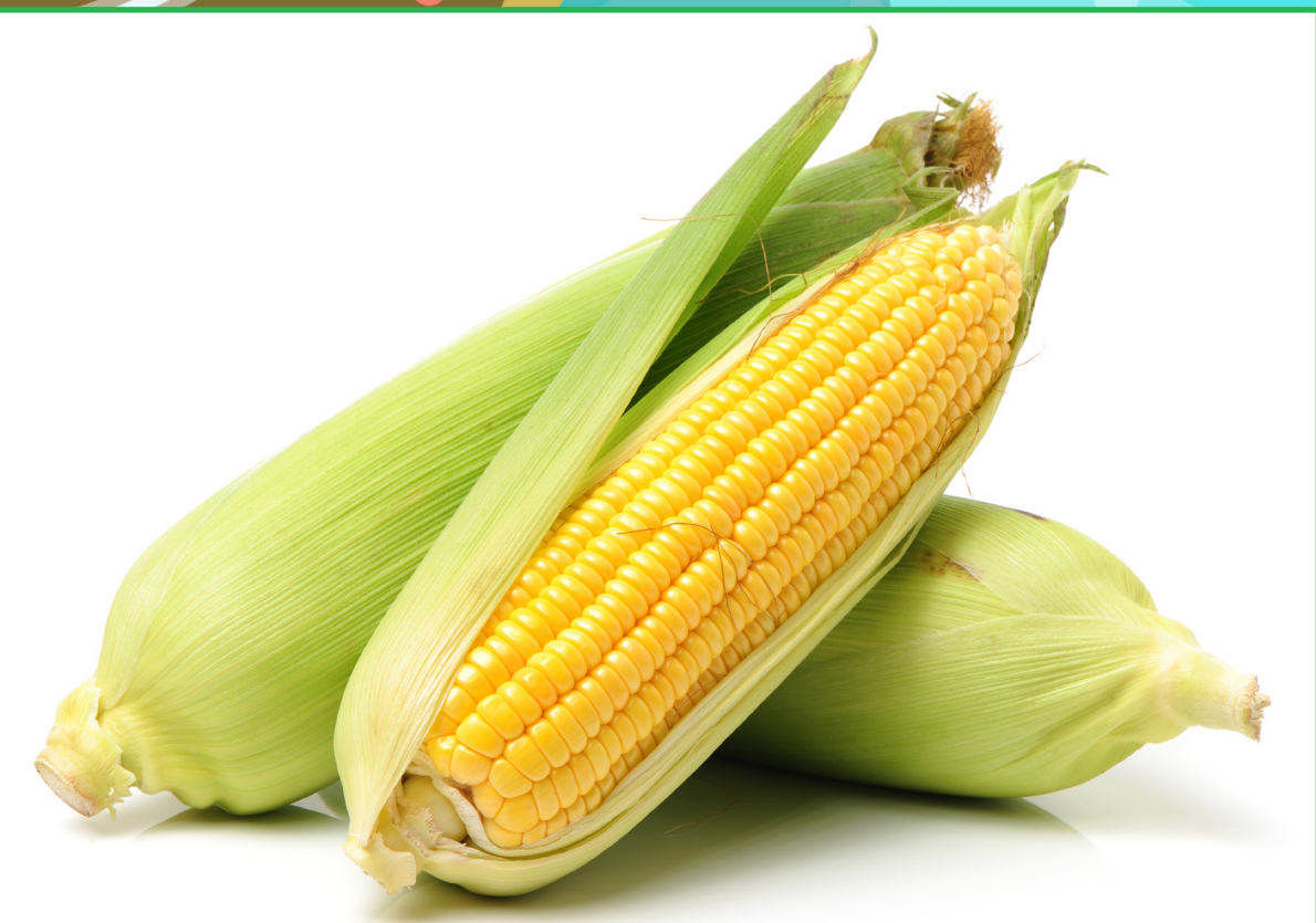
Fresh In-Husk, Bi-Color Sweet Corn 6 for $3