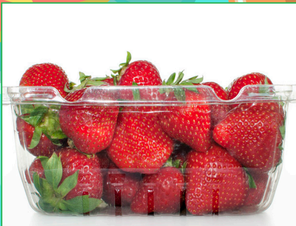
1 lb. Carton, Sweet Red California Strawberries $3.99 ea.