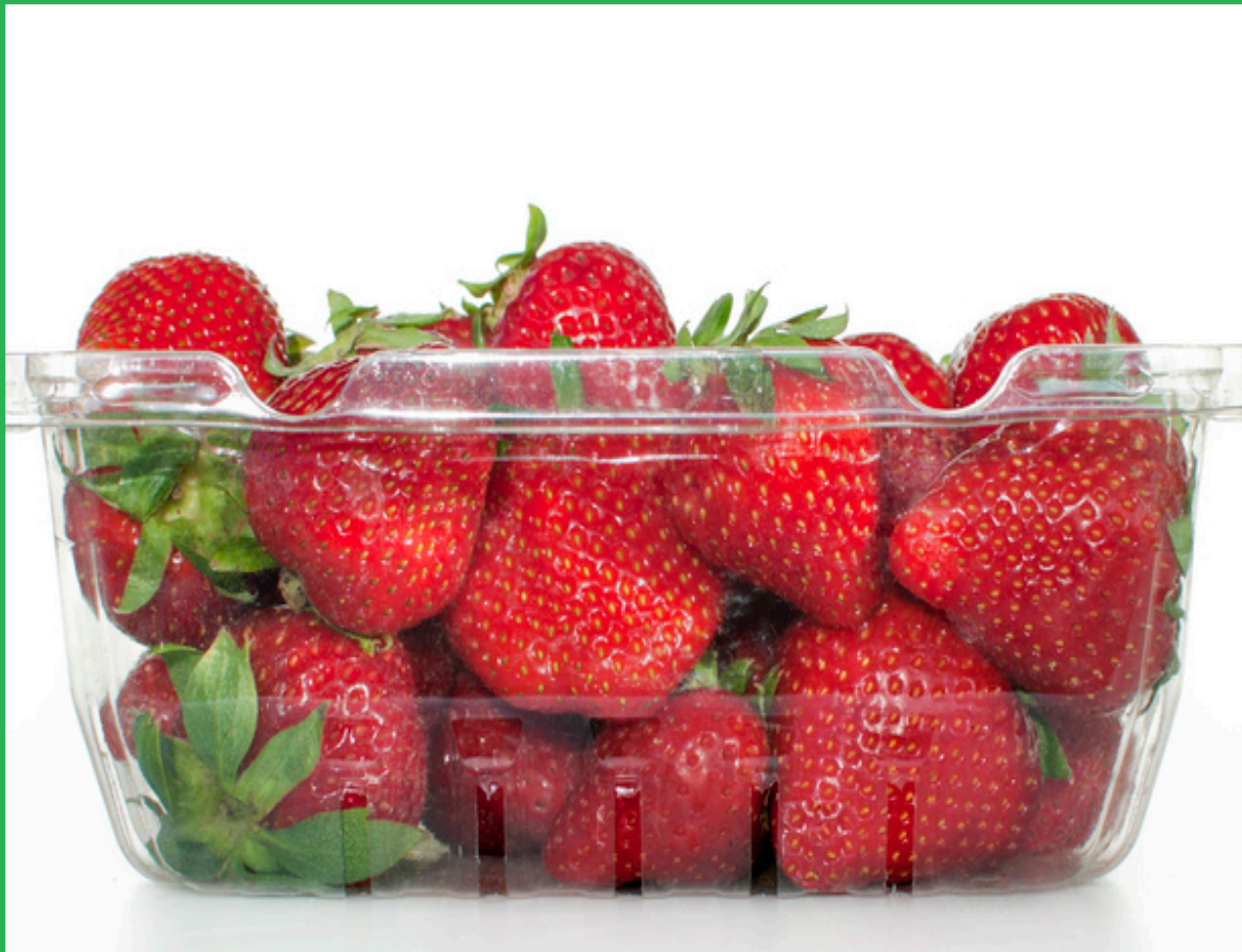
1 lb. Carton California Strawberries 2 for $7