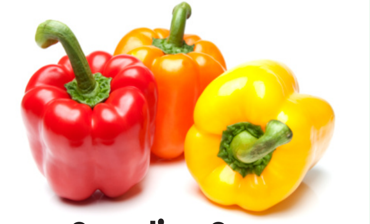
Canadian Grown Fresh Picked Red, Yellow, or Orange Bell Peppers $2.99 lb.