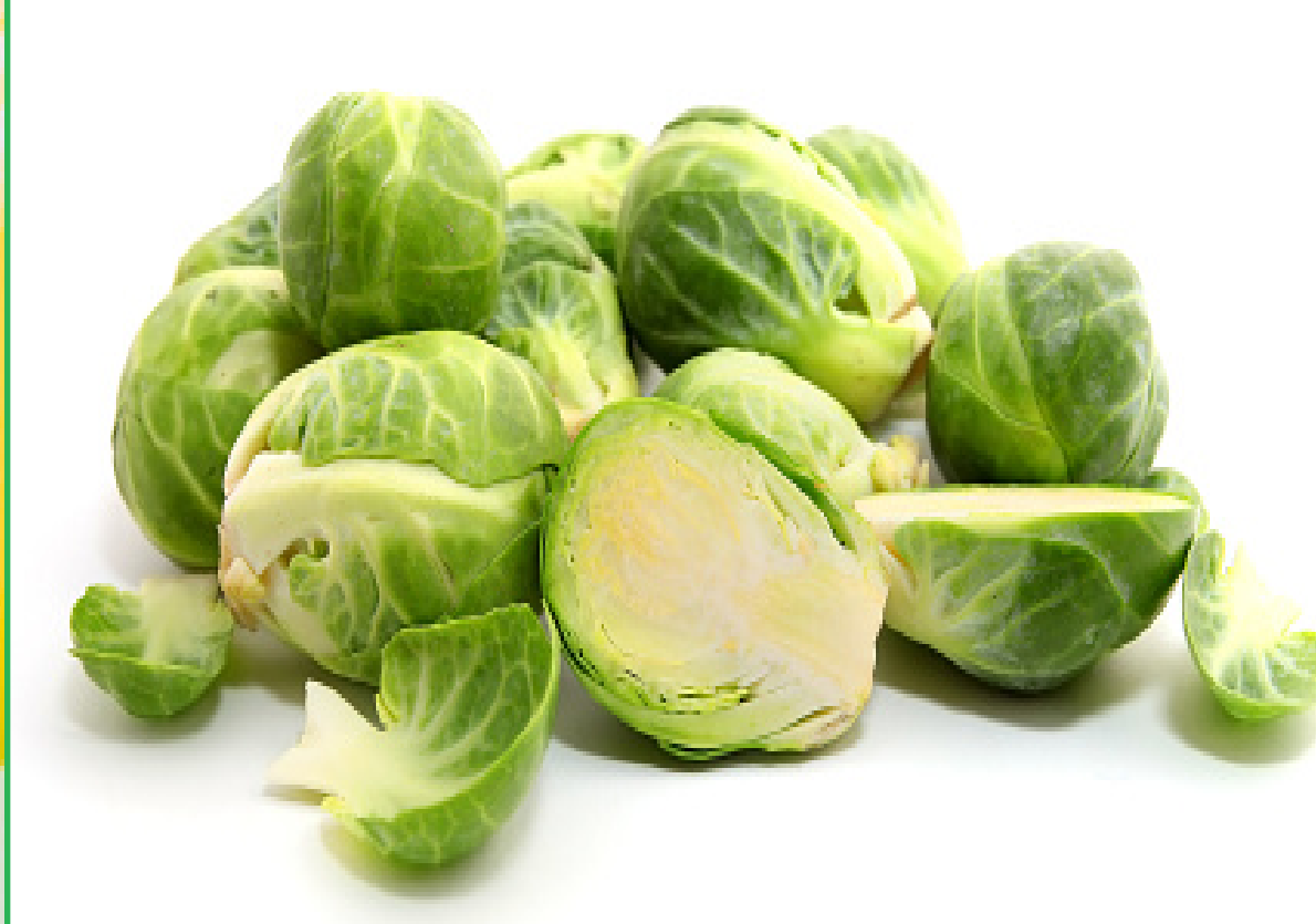
Fresh Picked California Brussel Sprouts $1.99 lb.