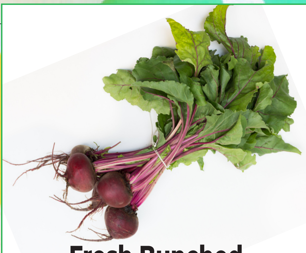
Fresh Bunched Organic Red Beets 2 for $6