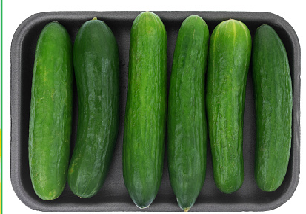
Canadian Grown 6 Pack Package Mini Seedless Cucumbers 2 for $5